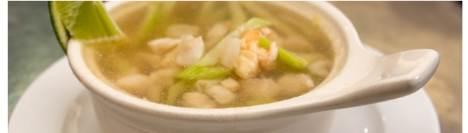
Dine out small cup 16oz | Big (Large) Cup 32oz